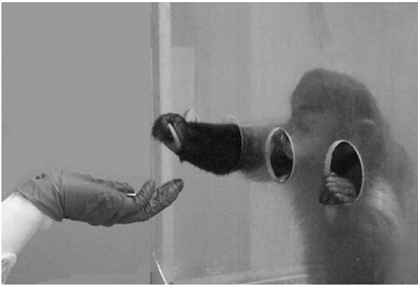
Figure 1. A photograph depicting the token exchange method in capuchins. Here, one capuchin subject, Auric, trades a token for a food reward.

situation therefore provides a useful benchmark against which to test for an irrational bias such as the endowment effect since this populations' previous performance indicates that they can behave rationally in some market contexts—they rationally respond to price cuts, re-budget tokens towards cheaper goods in a way that is well described by rational maximizer models, etc.