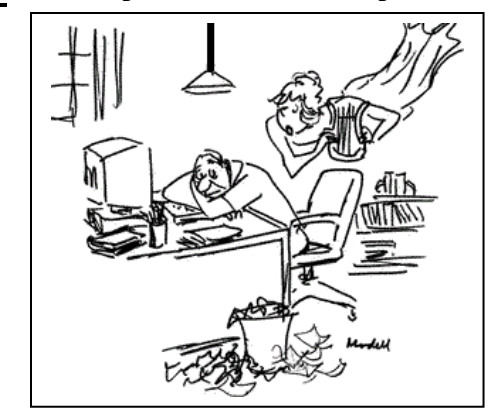
"Hold on. I'm going to have to call for back up."