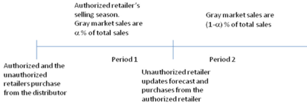
Figure 3. Sequence of events in a channel with a distributor and two classes of retailers