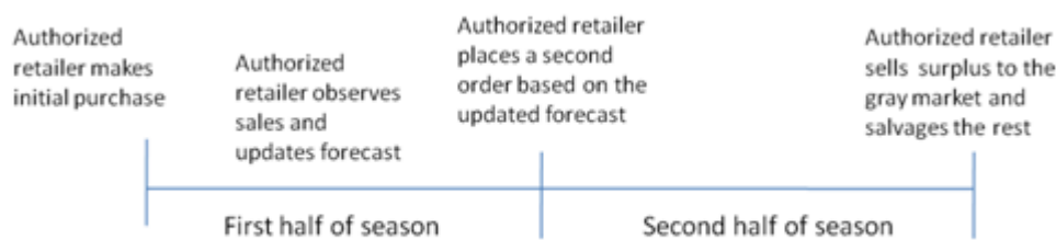
Figure 2. Sequence of events whereby the authorized retailer purchases twice in a season

The value of two replenishments depends on retail margins, size of the gray market, and price to the gray market, C_3 . Proposition 4 gives us the means to compare performance of the dual replenishment system to that of a single replenishment system for different prices of C_3 and different service levels. Additional notation: