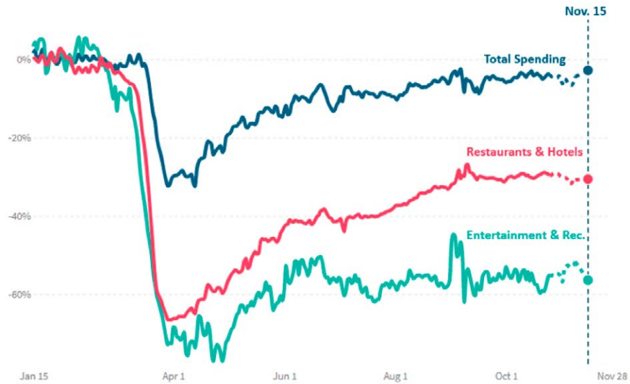
Exhibit 3 High frequency data show consumer spending on services slowing further in recent weeks