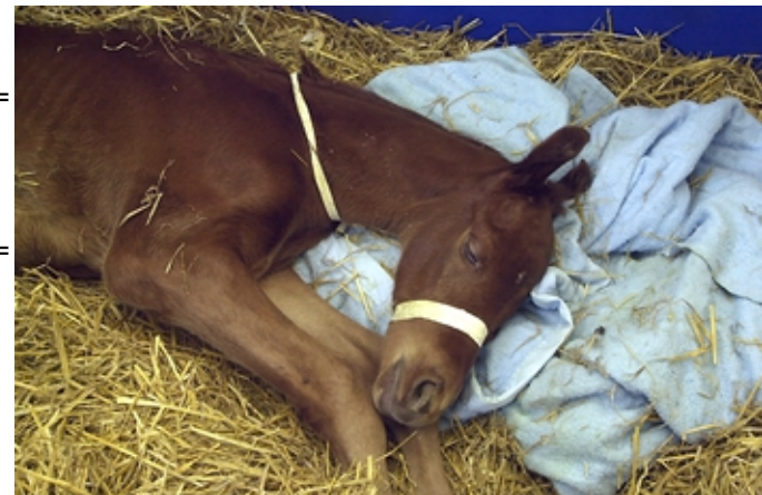
05/13/2001- A sick foal rested at Rood & Riddle Equine Hospital in Lexington on Friday as Kentucky's dead-foal count reached 404.

A group of key researchers gathered yesterday for a scientific "summit